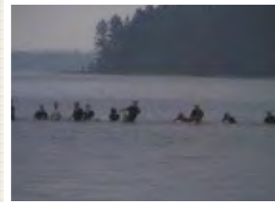
6:00 AM WATER TRAINING

MEN, WOMEN, AND CHILDREN ALL FACE THE SAME HARD COURSE.