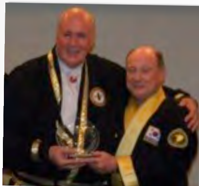
GM BAUBIL PRESENTS GIFT