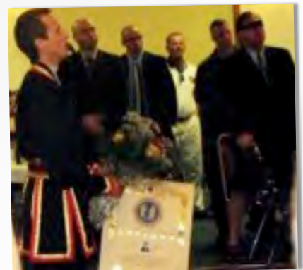
PASSING THE ART